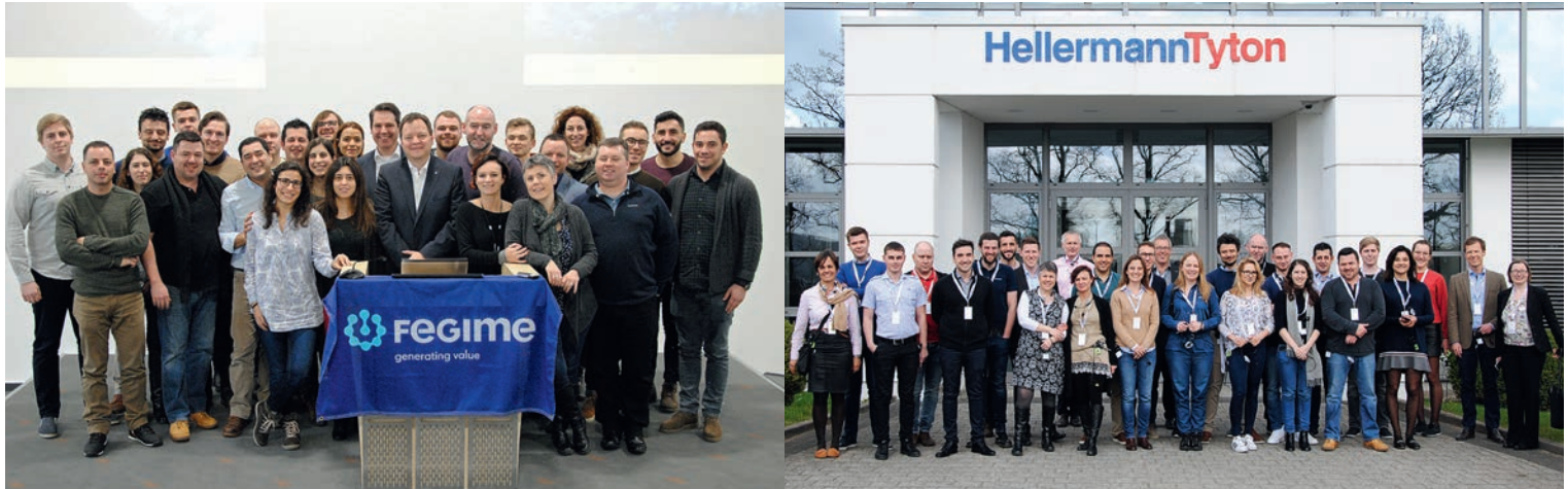
The FEGIME Think Tank sharing ideas with good partners: left with OBO, right with HellermannTyton.