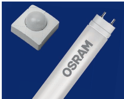
The "SubstiTUBE Connected" can be used to replace conventional T8 tubes. Together with the sensor (small photo) it is very easy to create an efficient light management system.

In the Panel segment LEDVANCE is expanding its selection of different formats with new models for system ceilings with 1200 module dimensions. In addition they offer practical surface-mount frames for square 600, 625 and 1,200 grids, enabling these luminaires also to be used outside the grid.