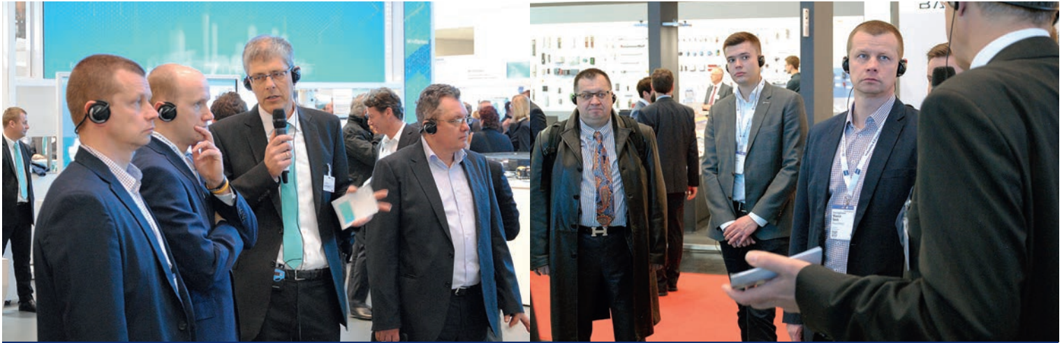
At the Hannover Fair Siemens presented their portfolio of hardware and software designed to enable businesses of all sizes to profit from digitalisation.

rules, guidelines and also ethics throughout society. A clear differentiation between business and private life will become a challenge. How to select the right sources, filter the content and master the information flood, must be part of the education goals for employees and management. To help the user to select the right information in the fast increasing data pools, industry will have to establish common #-tags.