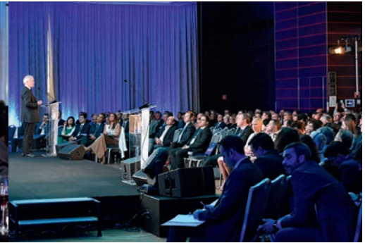
The Congress programme is diverse. The topics range from the transition from one generation to the next in family business to EU energy policies.

>> ... more than twelve thousand kilometres to attend their first Congress. Even the Atlantic is not an obstacle – an intensive exchange of views and experience has already begun. “Keeping knowledge erodes power,” said David Garratt. “Sharing is the fuel to your growth engine.”