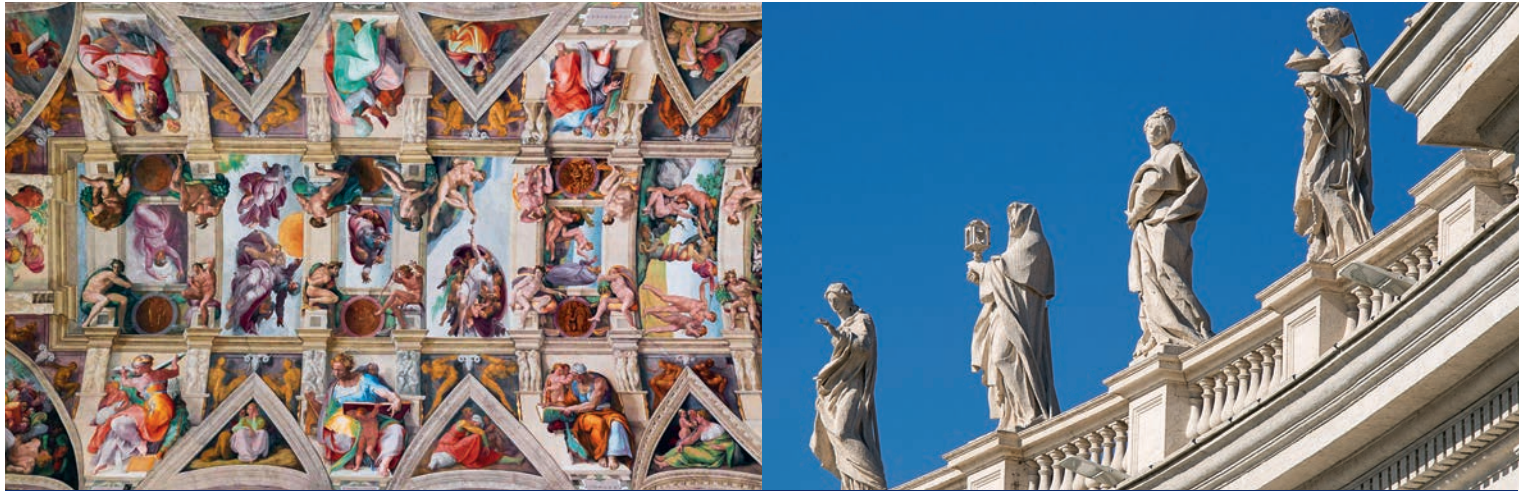
Left: Michelangelo's famous fresco in a new light. Right: the statues of the saints on the colonnade of St. Peter's.