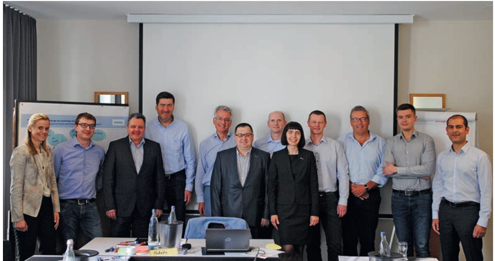
The Siemens hosts with the FEGIME delegation at the informative workshop in Kassel.

In April Siemens met with FEGIME colleagues from several countries to discuss digitalisation and the progress of common projects.