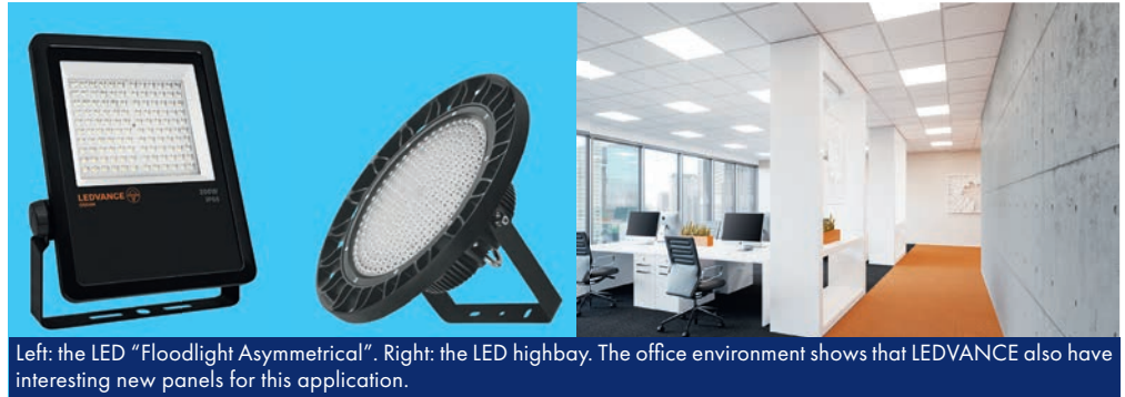
Left: the LED "Floodlight Asymmetrical". Right: the LED highbay. The office environment shows that LEDVANCE also have interesting new panels for this application.

LEDVANCE's drive for innovation is well received by the market – and it is not over yet as our selection of new products shows.