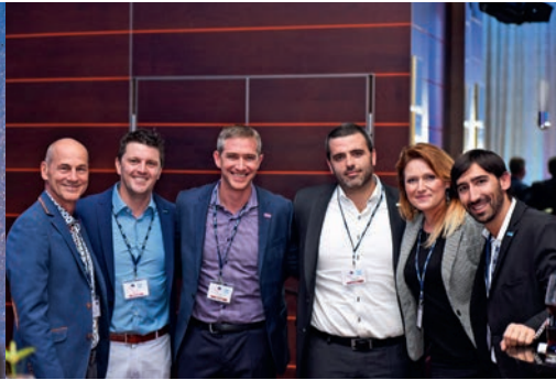
The delegation from Argentina attended a Congress for the first time and enjoyed the exchange with their new European friends.