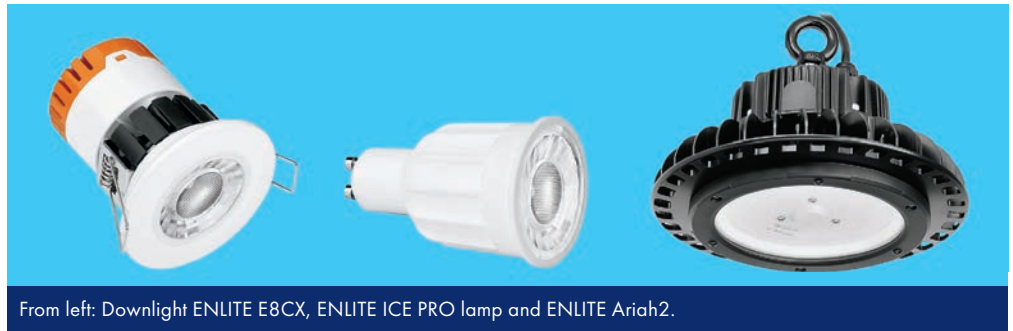
From left: Downlight ENLITE E8CX, ENLITE ICE PRO lamp and ENLITE Ariah2.

Highlights from Aurora's new ENLITE catalogue.