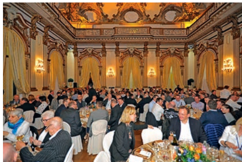
Participants really had to earn their dinner at the impressive Palazzo Brancaccio: a tour of the innumerable sights of the Eternal City was part of the programme.

Experts noted two things: first of all that LED provides safe illumination for delicate works of art because its spectrum only contains very low levels